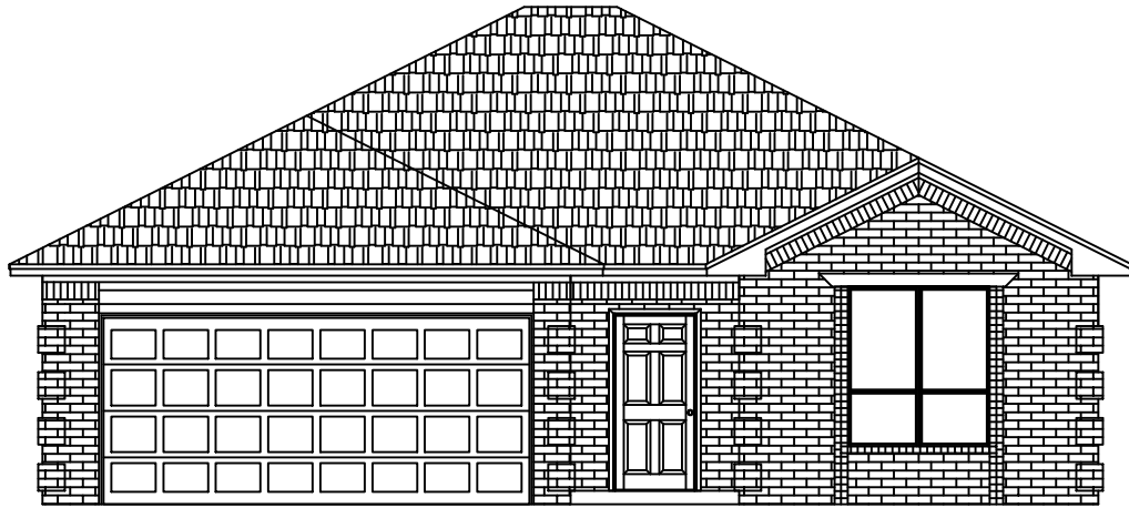
THE WINGATE ELEVATION